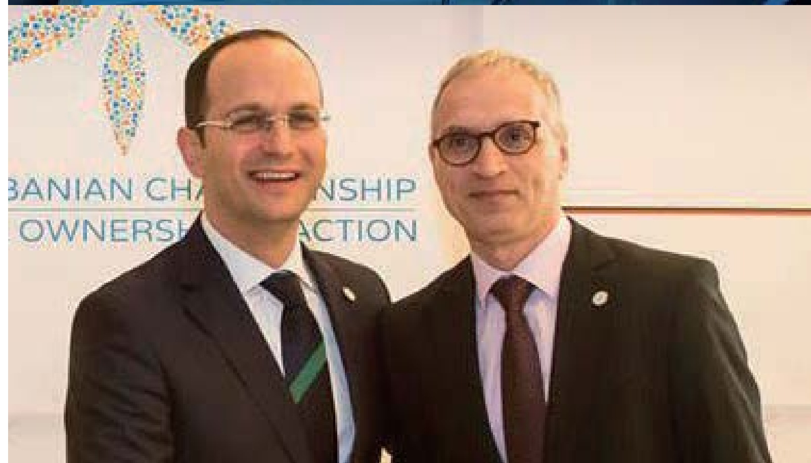
RCC Secretary General, Goran Svilanovic (right), with Minister of Foreign Affairs of Albania, Ditmir Bushati, in Tirana on 24 February 2015.