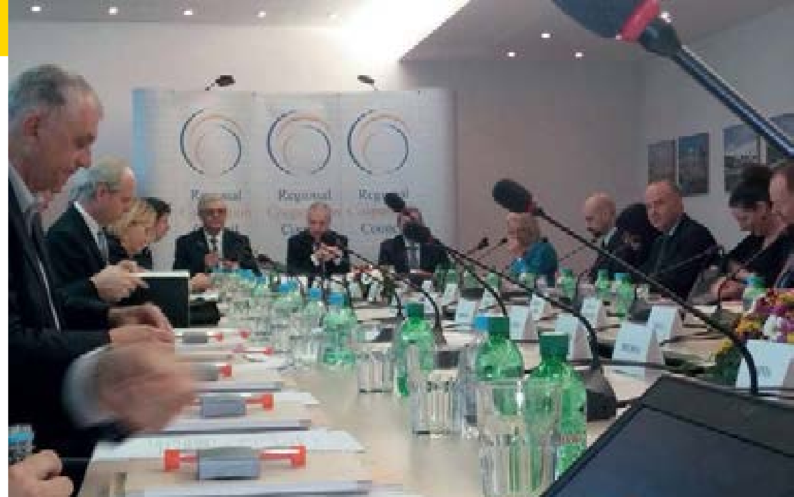
Meeting of the RCC Board, 26 February 2015.

Further, a forward-looking dialogue has been established with Bulgaria in the context of its forthcoming SEECF CiO for 2015-2016. In preparation for a result-oriented synergy, the RCC Secretariat and Bulgaria have embarked on a process to synchronise their work plans and particularly to identify areas of joint action. Furthermore, it is notable that, in 2016, the incoming Bulgarian SEECF CiO will mark the 20th anniversary of the SEECF. This will represent an opportunity to review the track-record of SEE region and generate the kind of comprehensive political support that