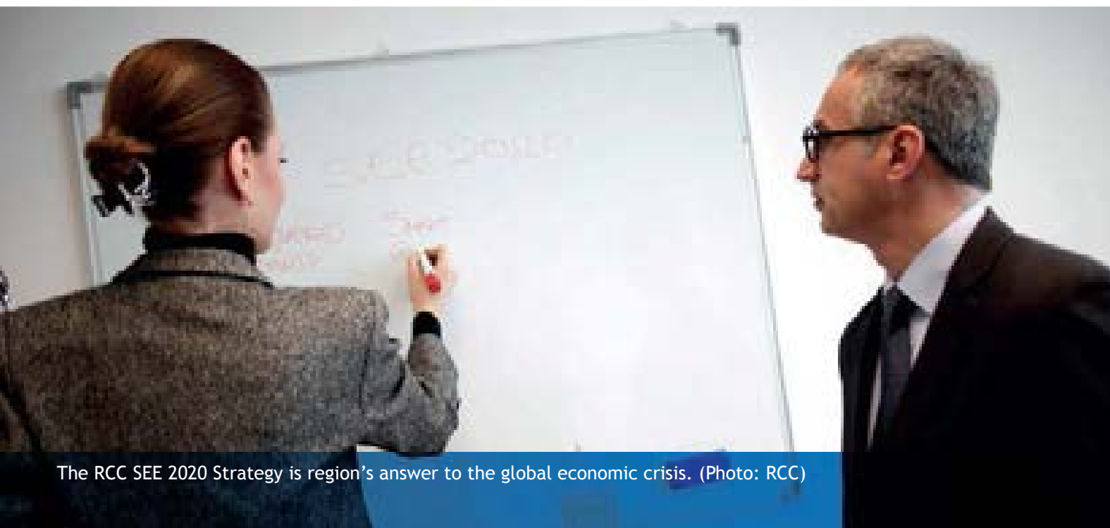
The RCC SEE 2020 Strategy is region's answer to the global economic crisis.

The Annual Report 2014-2015 unveils the progress made by the RCC in pursuing its mandate. It articulates the outcomes of the synergy with the SEECP and the dialogue with the RCC participants, while underlining their impact on the capacities of the RCC Secretariat to respond to the fast-paced and demanding regional environment in South East Europe. The report presents the results attained in the implementation of the first phase (2014) of the RCC Strategy and Work Programme (SWP) for 2014-2016, with an overt emphasis on the South East Europe (SEE) 2020 Strategy entitled: Jobs and Prosperity in a European Perspective.