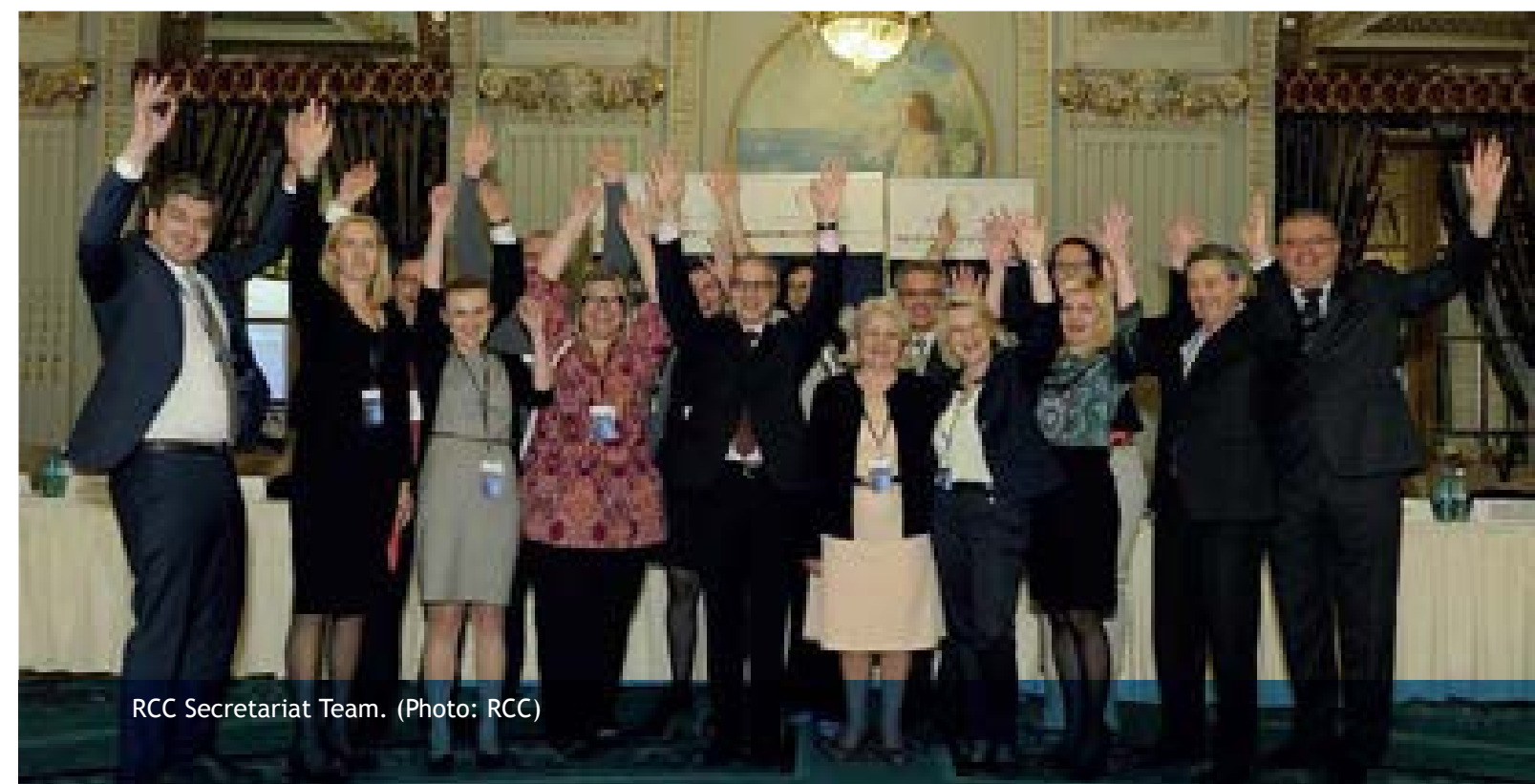
RCC Secretariat Team.

During 2014, the RCC participants from SEE region moved forward, in accordance with their individual merits, in the process of European and Euro-Atlantic integration. The efforts invested both by the EU and the SEE region remained the key element behind the momentum of the EU enlargement policy. The RCC participants from SEE that are already members of the EU have also brought a particular added-value and made a specific contribution in this respect. At the same time, the progress made in the region in terms of accession, including the need to address the conditions conducive to a lack of continuous progress, underscored the importance of a greater emphasis