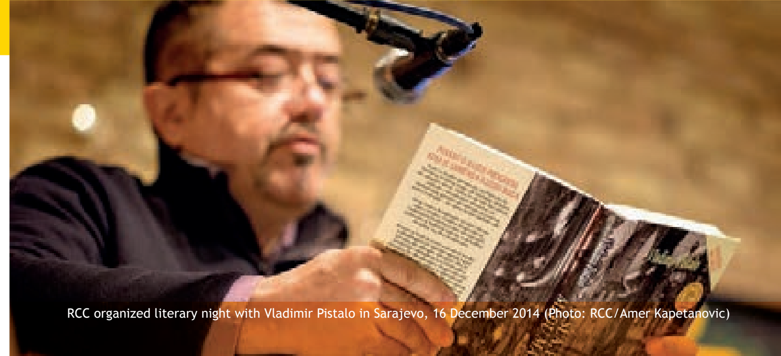
RCC organized literary night with Vladimir Pistalo in Sarajevo, 16 December 2014

Dynamic actions were carried out in relation to the monitoring and assessment of the SEE2020 Strategy, particularly regarding data collection for both qualitative and quantitative indicators. Possible joint activities with UNESCO will be implemented to mutually complement the existing policy tools and organise a joint training for the beneficiaries. Coordination with the international NGOs was intensified in developing joint projects such as the one on summer school for innovative on-site learning with EUROCLIO or further development of site management plans with Cultural Heritage without Borders.