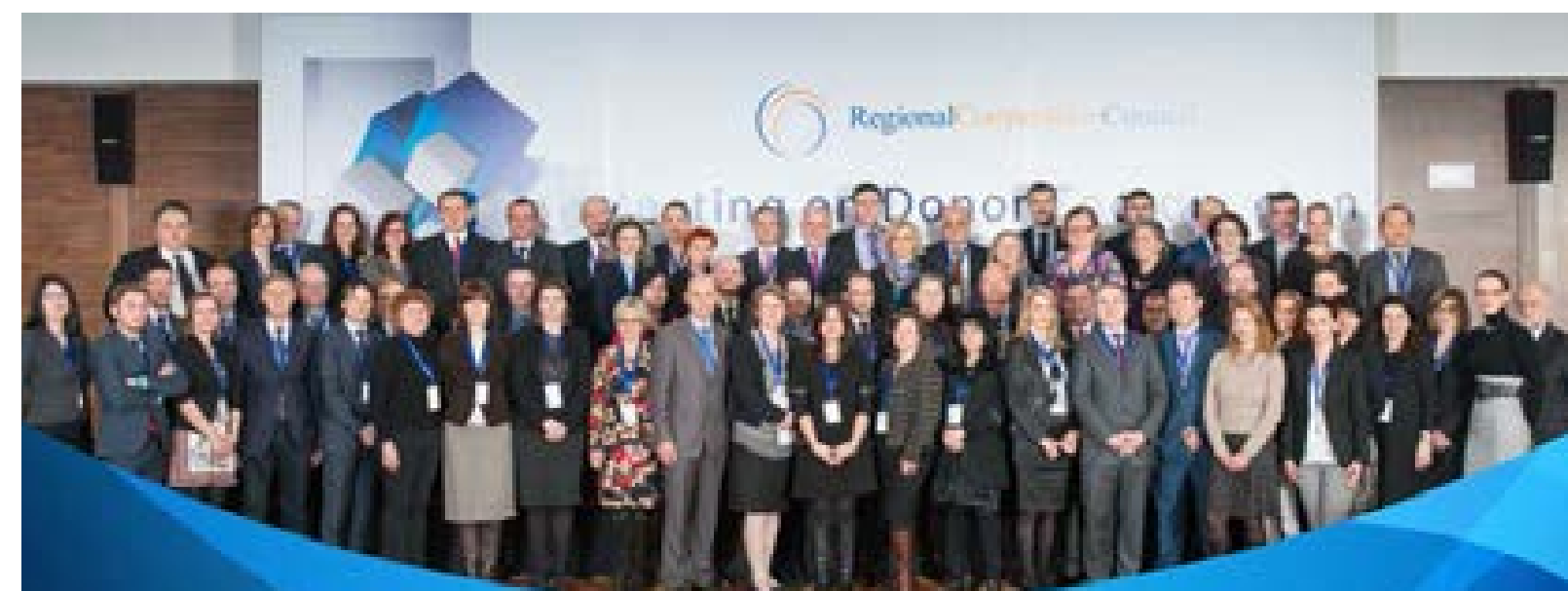
Meeting on Donor Coordination in the Western Balkans Sarajevo, 12-13 February 2015

In addition to these horizontal activities, RCC conducted a number of direct interventions to help implement the SEE 2020. The summary of these interventions structured in the five pillars of SEE 2020 Strategy is provided below.