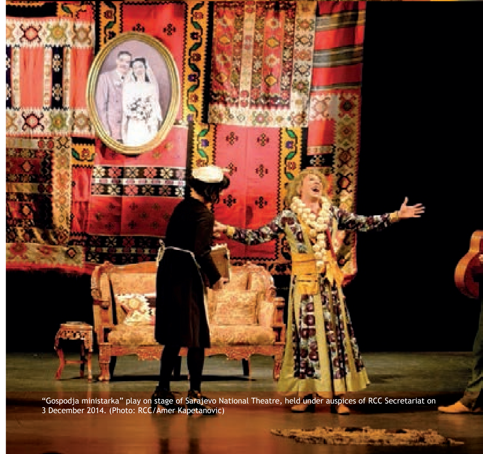
"Gospodja ministarka" play on stage of Sarajevo National Theatre, held under auspices of RCC Secretariat on 3 December 2014.